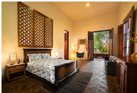
Catalina- 1 Queen-size 1 Sofabed-Double size