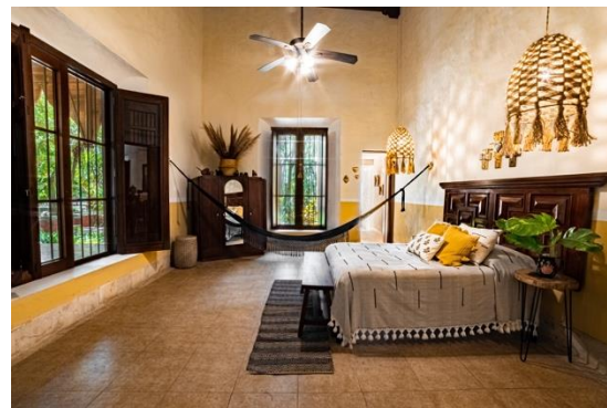
Rafaela - 1 Queen-size