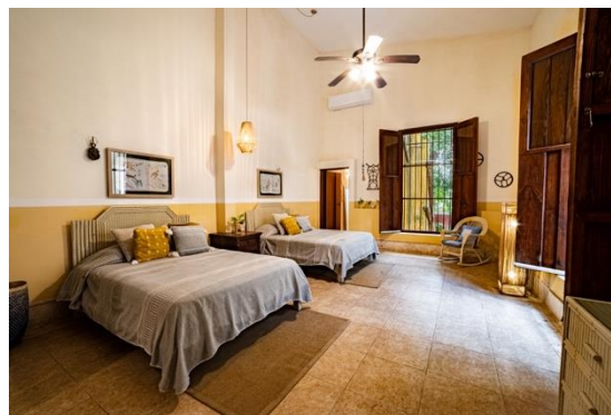
Elvia- 2 Queen-size